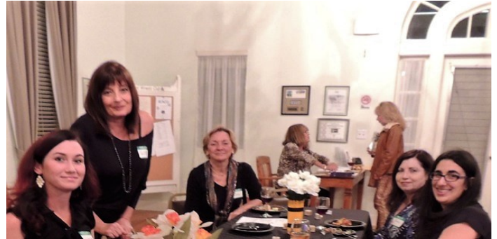
Members and Potential New Member